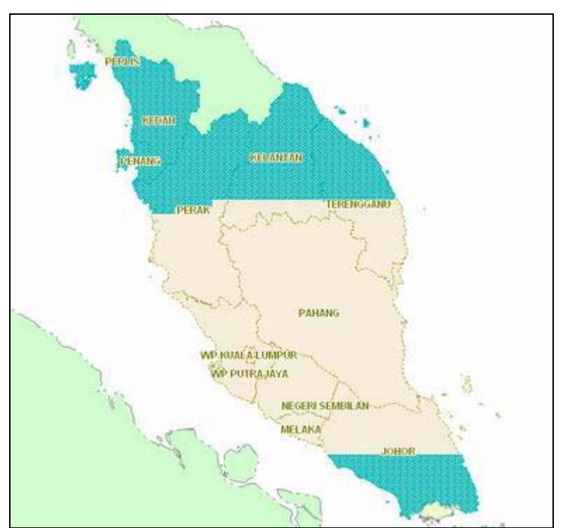
Map 1 (West Malaysia): Areas of coordination with Thailand & Singapore. = areas need to be coordinated